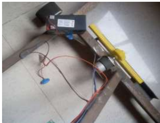
Fig 6: Battery operations