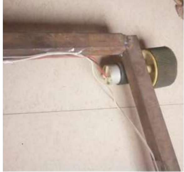
Fig 2: Wheels motor Alignment

A chassis consists of an internal framework that supports a manmade object in its construction and use. It is analogous to an animal's skeleton. An example of a chassis is the under part of a motor vehicle, consisting of the frame. Sometimes the goal of using a gear motor is to reduce the rotating shaft speed of a motor in the device being driven, such as in a small electric clock where the tiny synchronous motor may be spinning at 500 rpm but is reduced to one rpm to drive the second hand, and further reduced in the clock mechanism to drive the minute and hour hands