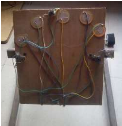
Fig 4: Piezoelectric Sensor

Wheels, in conjunction with axles, allow heavy objects to be moved easily facilitating movement or transportation while supporting a load, or performing labor in machines. A stepper motor (or step motor) is a brushless DC electric motor that divides a full rotation into a number of equal steps. The motor's position can then be commanded to move and hold at one of these steps without any feedback sensor (an open-loop controller), as long as the motor is carefully sized to the application.