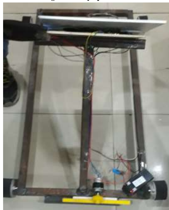
Fig 7: Chasis Construction