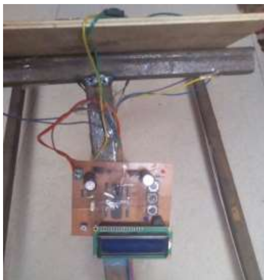
Fig 5: Display And Sensing recorder

Wheels, in conjunction with axles, allow heavy objects to be moved easily facilitating movement or transportation while supporting a load, or performing labor in machines. A stepper motor (or step motor) is a brushless DC electric motor that divides a full rotation into a number of equal steps. The motor's position can then be commanded to move and hold at one of these steps without any feedback sensor (an open-loop controller), as long as the motor is carefully sized to the application.