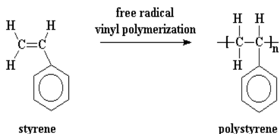
Fig. 1 Formation of polystyrene

polystyrene, but this raises the price of the commodity relative to new material. As a result, it is used in solid state molding processes. Formation of polystyrene from styrene by free radical vinyl polymerization, is shown in figure 1.