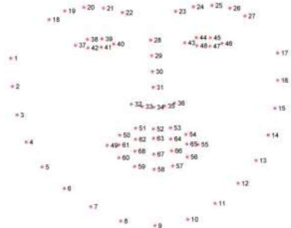
Figure 2: Facial Landmarks

The 2-D facial landmarks are considered for face feature extraction. Different features extracted from face are in the form of head features, distance and blink rate.