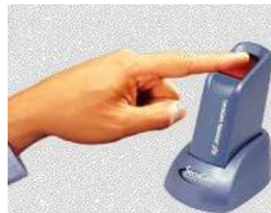
Figure 1: Fingerprint Scanner

Fingerprint is the most interesting and oldest human identity used for recognition of individual. In the early twentieth century, fingerprint was formally accepted as valid signs of identity by law-enforcement agencies.